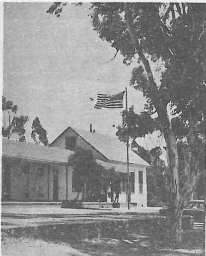
WE HAVE THE PINK SLIP ON THIS!

This plan is purely communal, above partisan politics, and there are, so far as I can see, no in-