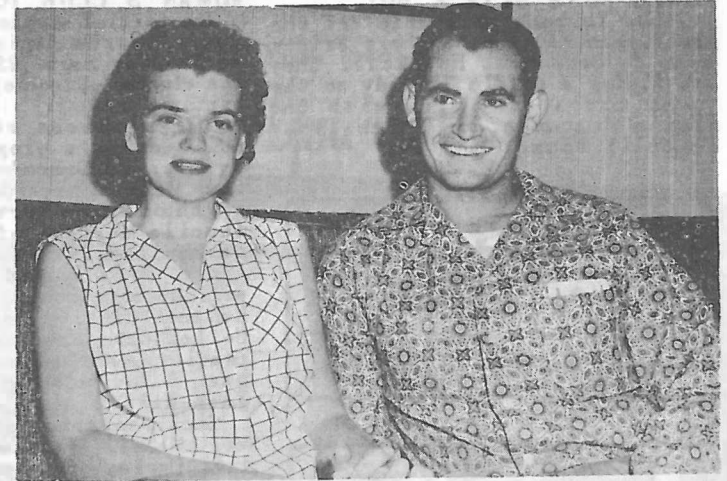
COLLEGE ROMANCE WINDS UP IN ALPINE.